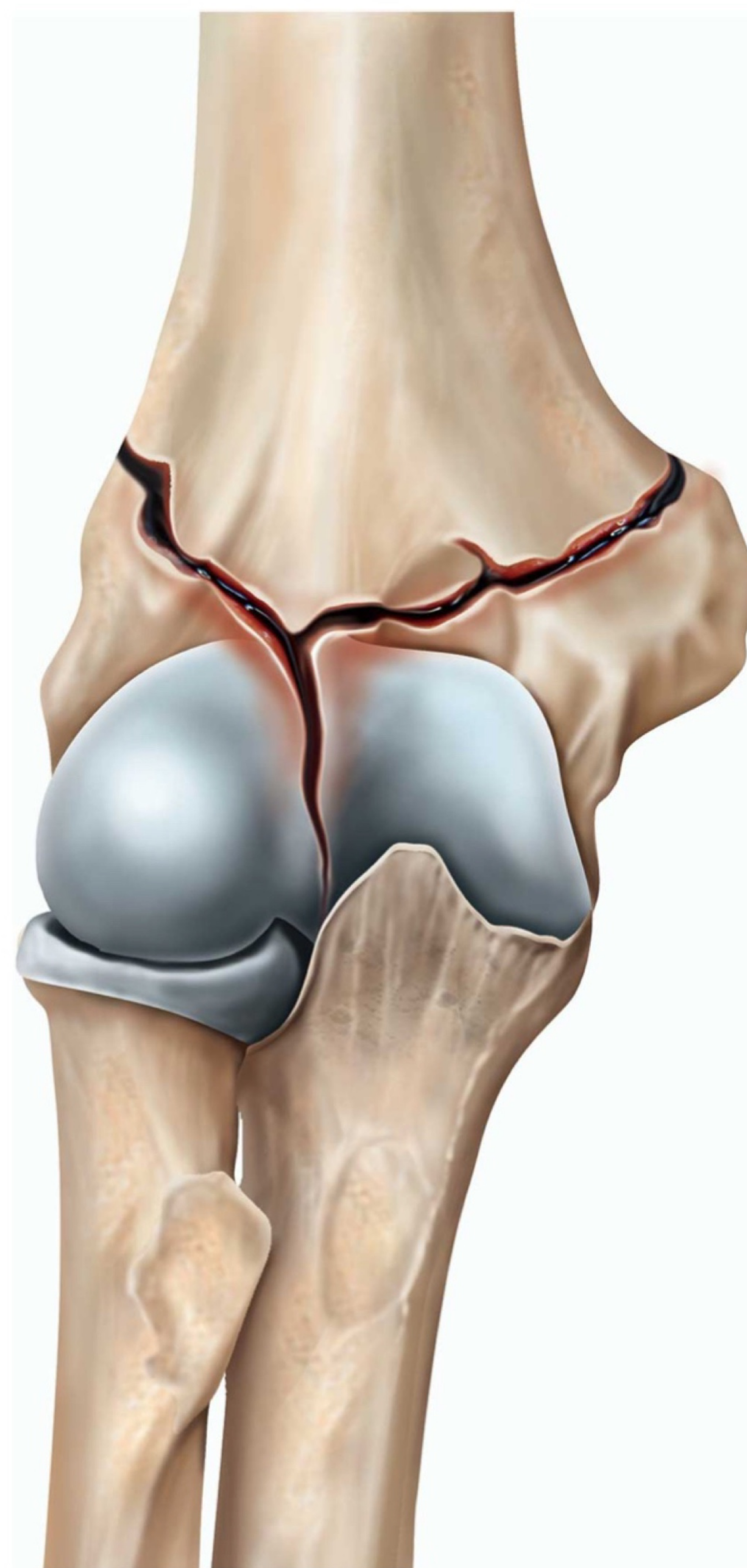
An elbow fracture

Surgery gives better long-term results the earlier it is performed.