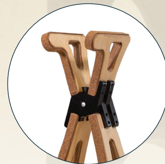
MANDOLIN STAND Natural look with cork padding that protects your instrument.