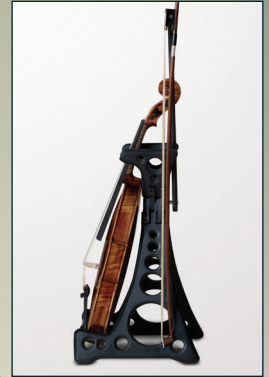
MINI X STAND Shown in Concert Black with optional bow holder attachment*.