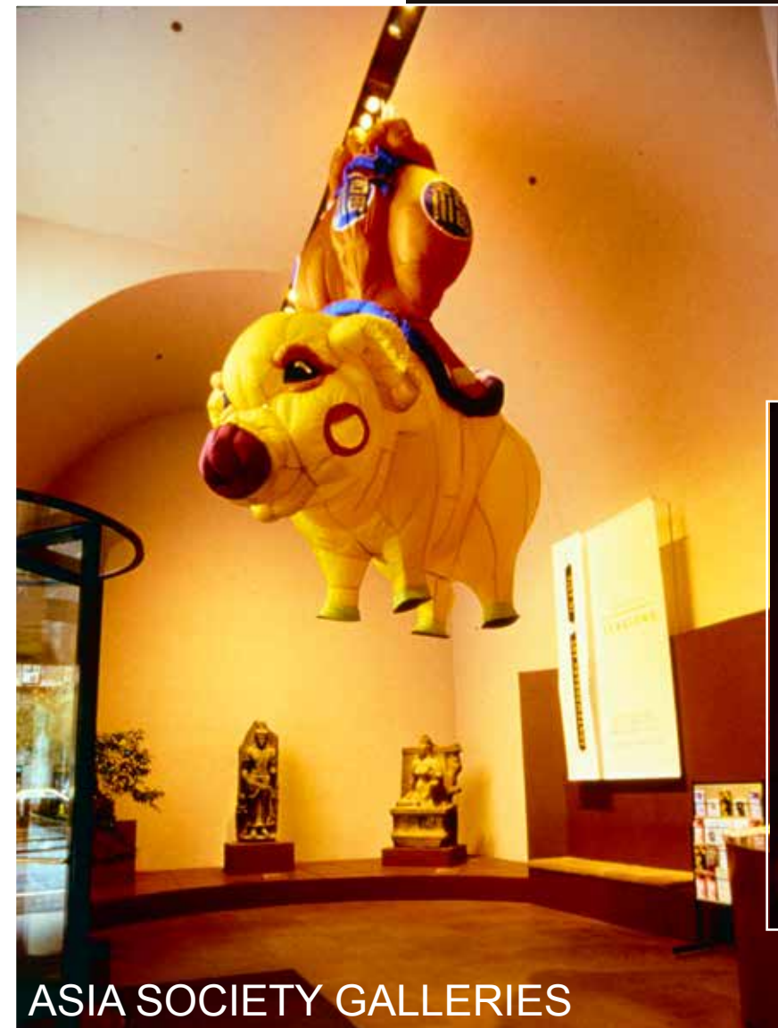
ASIA SOCIETY GALLERIES