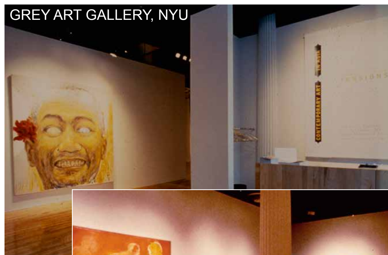
GREY ART GALLERY, NYU