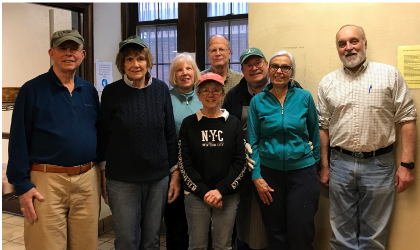
The Trinity crew at the March 25 Cathedral dinner.

We completed two successful dinners in January and March. Community Meals has just confirmed the dates for more dinners this year. They will start back up in the summer and into the fall, so please add three dates to your calendar for reference: July 22, September 23 and November 25.