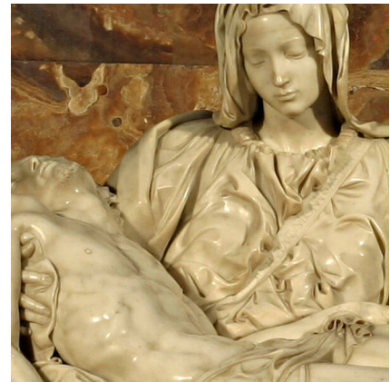
Pieta by Michelangelo.