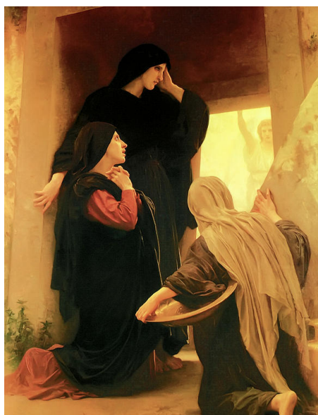
Three Marys at the Tomb, William-Adolphe Bouguereau, 1825-1905.