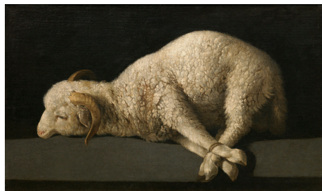
Lamb by Francisco Zurbarán, 1638