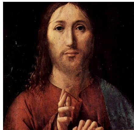
Savior of the World, Antonello da Messina, 1465