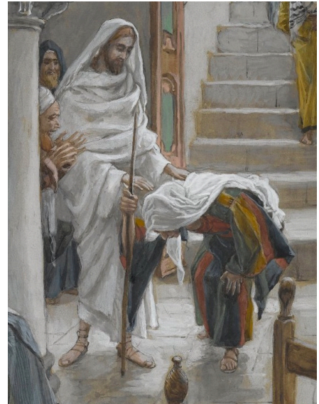
Woman with an Infirmary of Eighteen Years, 1886-1894, James Tissot.

Your faithful stewardship is very much appreciated by South Park Inn and the fact that some of the items are fully stocked is reflective of your generous giving.