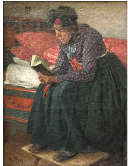
Personal Devotions, 1881-1891, Adolf Hölzel.