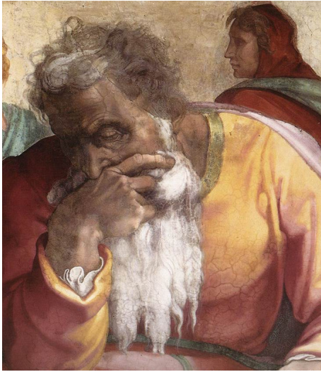
Jeremiah, Michelangelo Buonarroti, 1511