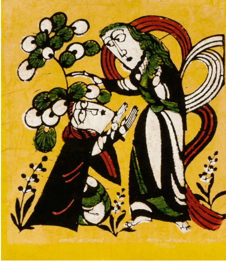
Woman of Canaan, Sadao Watanabe, circa 1940-96