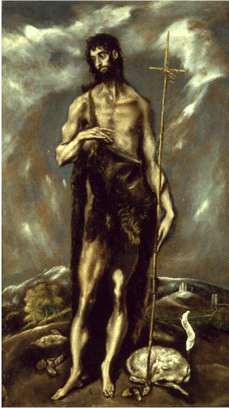
Saint John the Baptist, El Greco, circa 1600 (Scripture: Matthew 3:1-12)