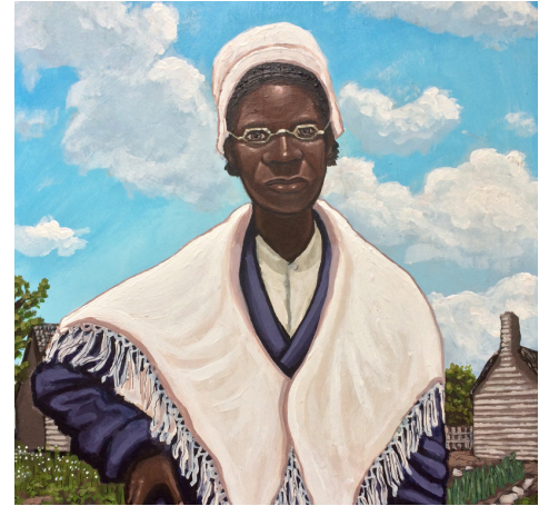
Sojourner Truth, Kelly Latimore, 2018 (Scripture: Isaiah 35:1-10)