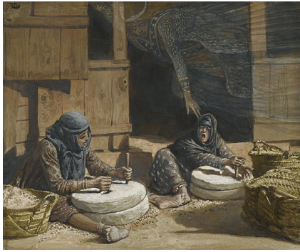
Two Women at the Mill, James Tissot, between 1886 and 1894 (Scripture: Matthew 24:36-44)