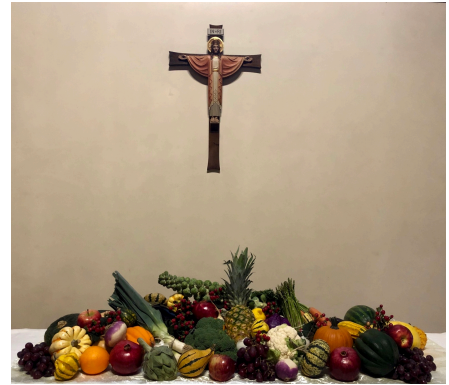
Harvest Arrangement designed for the Interfaith Thanksgiving Service on November 26