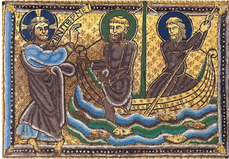
Calling of Saints Peter and Andrew, English engraving c. 1160-1180, The Metropolitan Museum of Art, New York City (Scripture: Matthew 4:12-23)