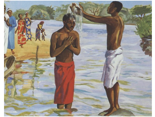
John Baptizes Jesus, JESUS MAFA,, 1973 (Scripture: Matthew 3:13-17)