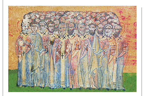
Seventy Disciples, from a Greek manuscript, 15th Century, artist unknown.