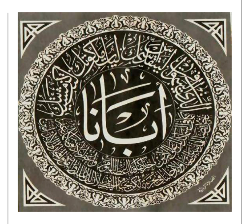
Lord's Prayer in Arabic Calligraphy, artist unknown, Paris.