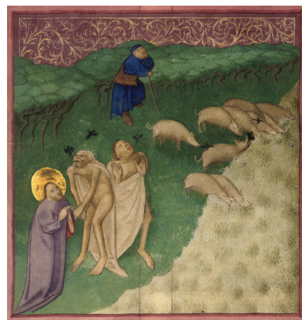
Jesus, Gerasene and Spirits, 1425, artist unknown, Germany