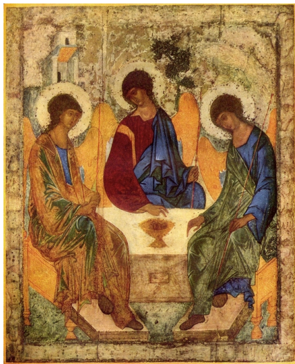
Holy Trinity, 1400, Andrei Rublev, Moscow, Russia