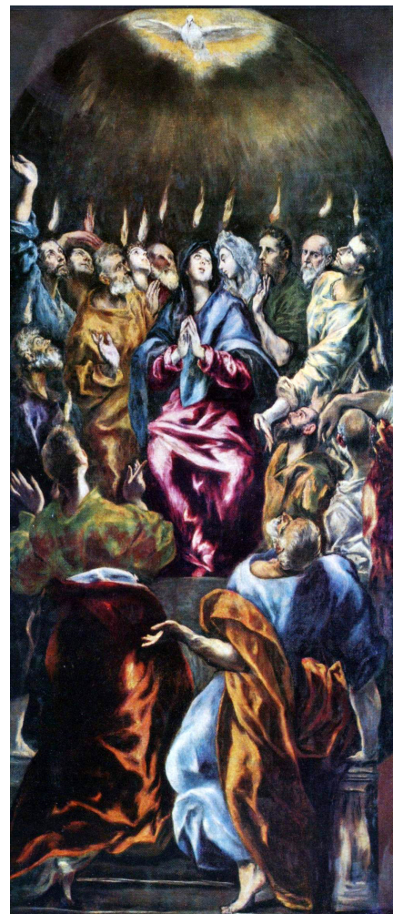
Descent of the Holy Spirit, 1604, El Greco, Museo del Prado, Madrid

Love God. Love your neighbor. Change the world.®