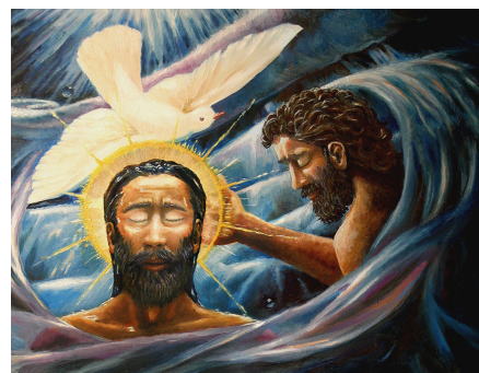
Baptism of Christ, 2005, Dave Zelenka, United States