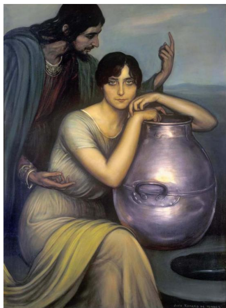
Christ and the Samaritan Woman, Julio Romero de Torres, 1874-1930 (Scripture: 3 Lent)