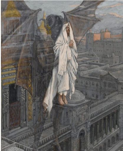
Jesus Carried Up to the Pinnacle of the Temple, James Jacques Joseph Tissot, 1886 (Scripture: 1 Lent, Temptation of Christ)