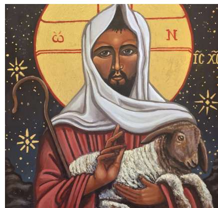
Good Shepherd, Kelly Latimore, 2019 (Scripture: 4 Lent)