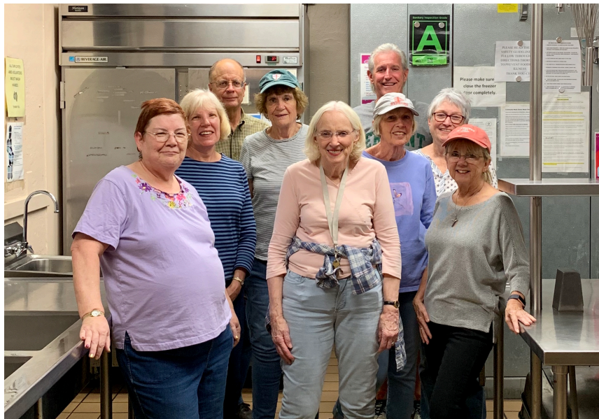
The crew from the September 29 community meal at Christ Church Cathedral where 102 dinners were served.