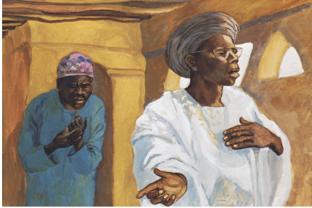
The Pharisee and the Publican, JESUS MAFA, 1973 (Scripture: Luke 18:9-14)