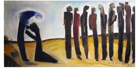
The Ten Lepers, Bill Hoover, 2013 (Scripture: Luke 17:11-19)