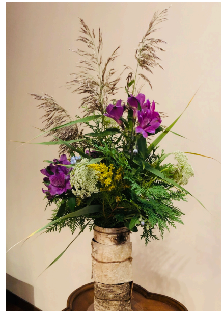
Our Altar Guild designed this floral arrangement to represent "Mountains and Hills" for the last week in our Season of Creation.