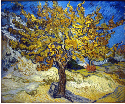
The Mulberry Tree, Vincent Van Gogh, 1889 (Scripture: Luke 17:5-10)