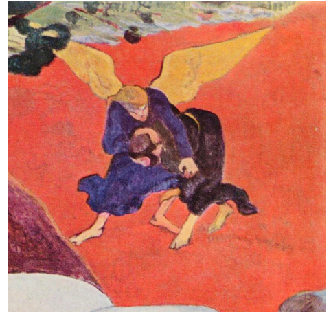
The Vision after the Sermon (partial), Paul Gauguin, 1888 (Scripture: Genesis 32:22-31)

November 3 will be the day that we celebrate All-Saints Day. At Trinity we especially remember those Trinity members who died during the last year. We also remember those individuals who lost their lives in the last year to mass shootings and major natural disasters. It is important on this day to reflect on the tragedy of mass shootings in American life and to reaffirm our determination to do what we can to remove its dark shadow.