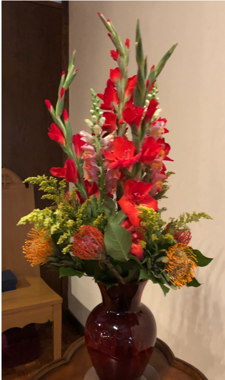
Our Altar Guild designed this floral arrangement to represent "Fire and Heat." Each arrangement during September was representative of our Season of Creation.