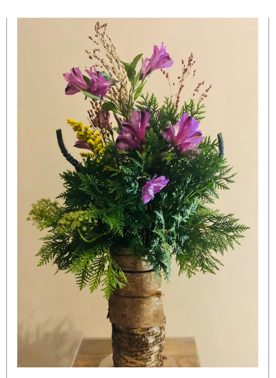
Many thanks to our Altar Guild for ensuring that our altar reflected the Season of Creation. Outdoor worshipers are also grateful for their time in setting up an altar outside under the chestnut trees.