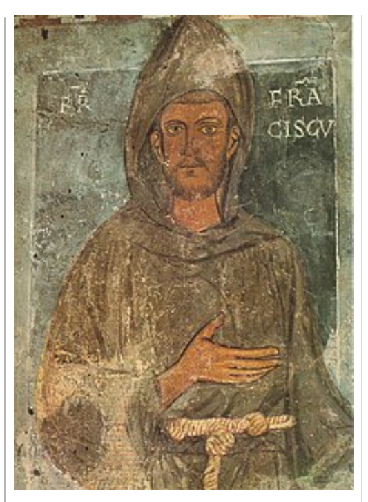
The oldest depiction of St. Francis is a fresco near the entrance of the Benedictine abbey of Subiaco, painted between March 1228 and March 1229.