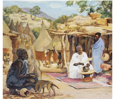
The Rich Man and Lazarus, 1973, JESUS MAFA (Scripture: Luke 16:19-31)

The shopping list includes gift cards (Walmart, grocery stores, fast food restaurants, Cost Cutters); bus passes; laundry detergent and cleaning supplies; new or lightly-used twin sheets and bath towels; underwear, t-shirts and pajamas (especially xl, 2xl and 3xl) for both men and women; adult incontinence products; new office supplies (copy paper, pens, pencils, post-its, file folders).