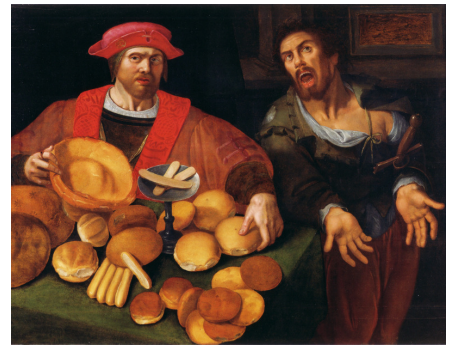
Rich and Poor, 17th century, unidentified Flemish painter (Scripture: Luke 16:1-13)

Lunch will be free and we will take a free-will offering to help with the cost of lunch and to aid women's ministries in Kafanchan Diocese.