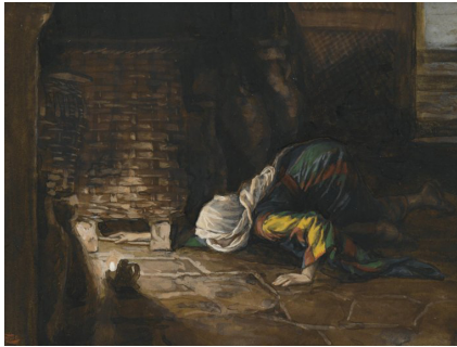
Lost Drachma, James Jacques Joseph Tissot, 1836-1902 (Scripture: Luke 15:1-10)