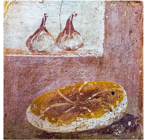
Still Life with Bread and Figs, 1st Century, unknown artist

Our goal this year is to support 50 students.