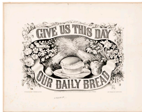
Give Us This Day Our Daily Bread, 1872, Currier & Ives