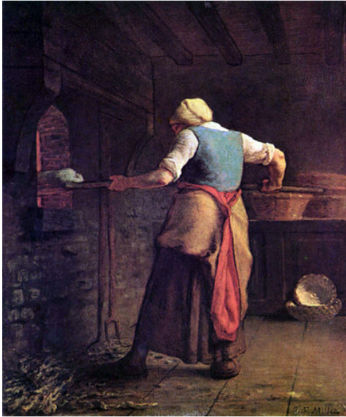
A Woman Baking Bread, 1854, Jean-Francois Millet