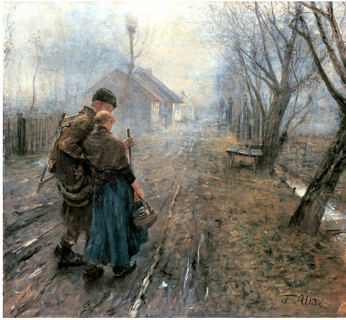
Difficult Journey - Transition to Bethlehem, Fritz von Uhde, 1890