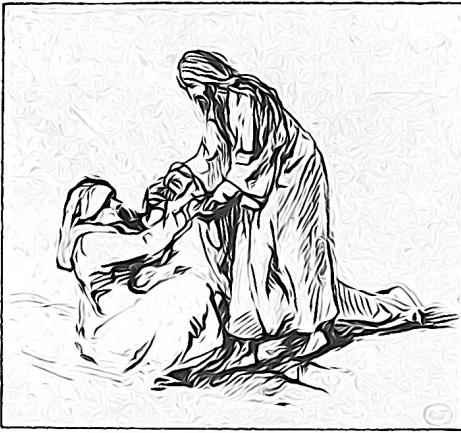
Christ Healing Peter's Mother-in-Law, Rembrandt, 17th century