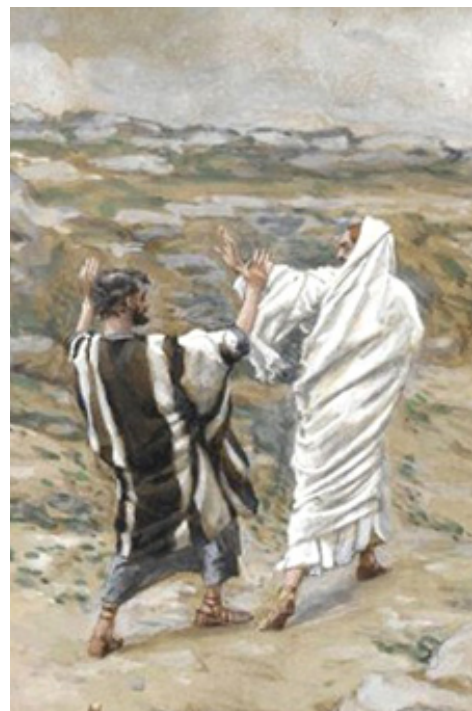
Get Thee Behind Me, Satan! James Tissot, 1886