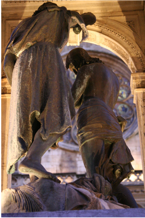
The Baptism of Christ, St. John's Cathedral in Lyon, France, 18th century