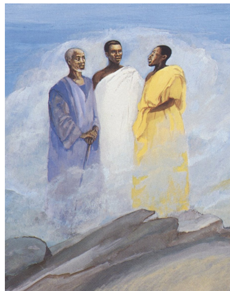
Transfiguration, JESUS MAFA, 1973

Human energy Burns out quickly, needs daily Spirit renewal.