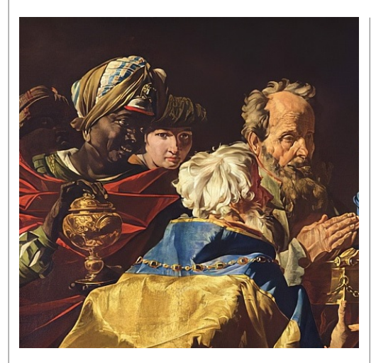
Adoration of the Magi, 17th century, Matthias Stom