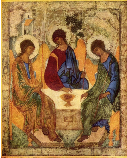
Holy Trinity, Andrei Rublev, 1400