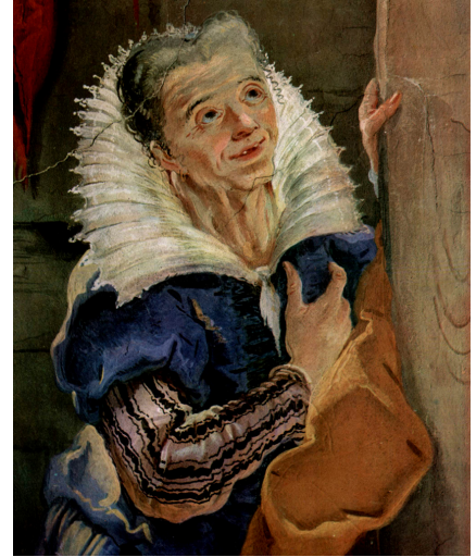
Detail from Angel Appears to Sarah , Giovanni Battista Tiepolo, 1726