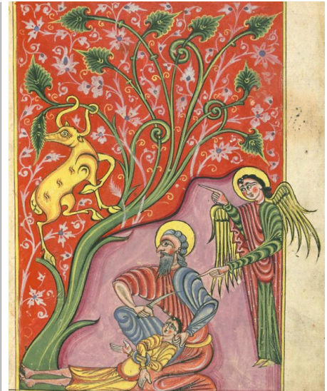
Sacrifice of Isaac, Armenian Gospel book, 1455