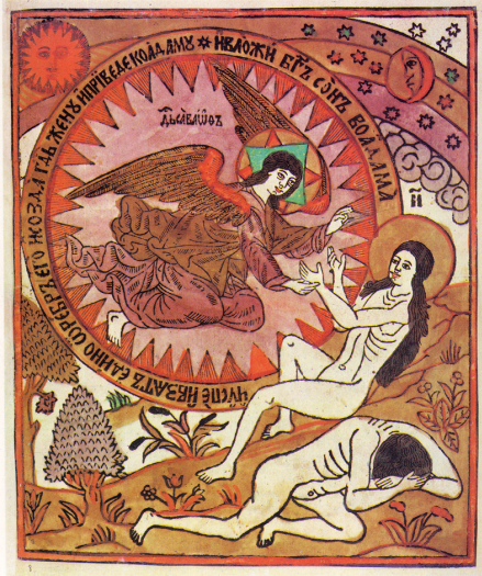
Creation of Adam and Eve, 1792, Russian lubok