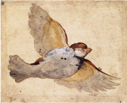
Study of a Flying Sparrow, between 1515 and 1520, Giovanni da Udine