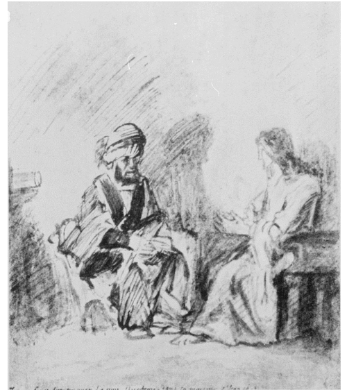
Christ and Nicodemus, Rembrandt, 1616-1669