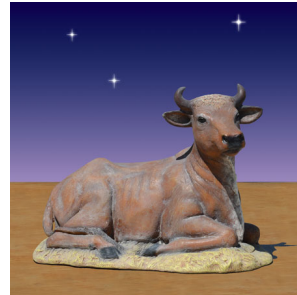
Resting Ox $458.85