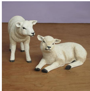
Resting or Standing Lambs $184 each