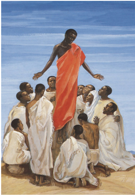
The Ascension, JESUS MAFA, 1973