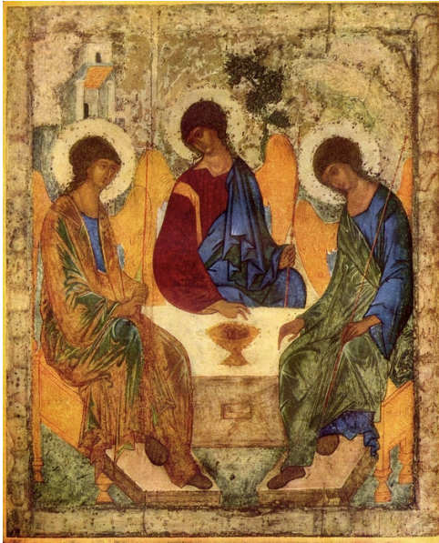
Trinity Sunday, Andrei Rublev, 1400