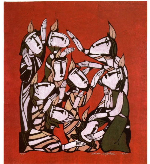
Pentecost, Sadao Watanabe, 1975