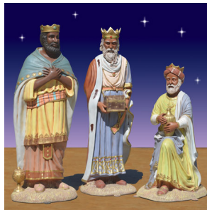
Three Kings $1,378

A donation can be made directly to the office with "Nativity Scene" written on the memo line. If you'd like to purchase a figure, please contact me. Orders should be placed by the end of summer in former for the figures to be available by the beginning of the Christmas season.