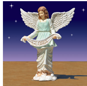
Angel or Gloria $573

Almighty God our heavenly Father, you declare your glory and show forth your handiwork in the heavens and in the earth: Deliver us in our various occupations from the service of self alone, that we may do the work you give us to do in truth and beauty and for the common good; for the sake of him who came among us as one who serves, your Son Jesus Christ our Lord, who lives and reigns with you and the Holy Spirit, one God, for ever and ever. Amen.