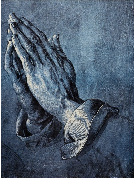
Praying Hands, 1508, Albrecht Dürer