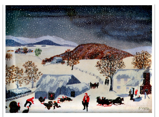
Catching the Thanksgiving Turkey Grandma Moses 1943