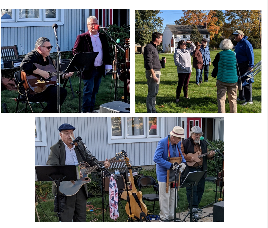
Scenes from the Kateri Benefit Concert.