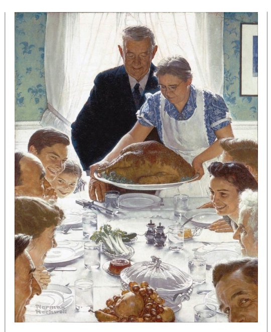
Freedom From Want, Norman Rockwell Saturday Evening Post March 6, 1943