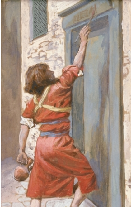
Signs on the Door, 1886-1902, James Jacques Joseph Tissot