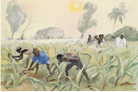
The Late-arriving Workers, 1973, JESUS MAFA