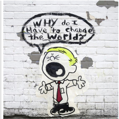
Why Do I Have To Change The World?, approximately 2017, NYC, NY