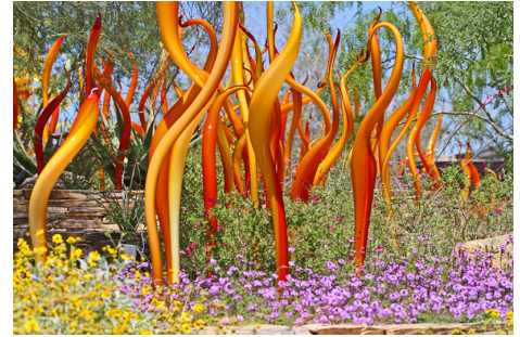
New Spirit, 2008-2009, Dale Chihuly

If you'd like to learn more about the business of the church, you can check out the monthly vestry minutes on our website at trinityepiscopalweth.org/vestry