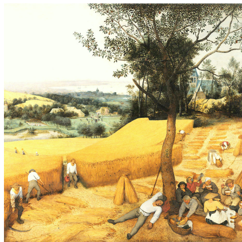
Harvesters, 1565, Peter Bruegel