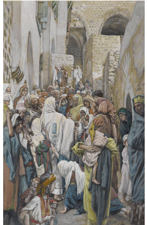
Woman with an Issue of Blood, 1886, James Tissot

machines for this program and has recently reached out to us for help. The machines are pedal-powered and cost $150 each. If you can help, please send a check for any amount with "Nana's sewing machines" in the memo line.