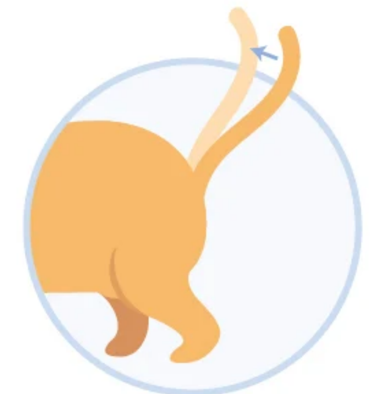
AGITATION or EXCITEMENT

https://bettervet.com/hs-fs/hubfs/tail-position-cat-infographic.jpg?width=868&height=1018&name=tail-position-cat-infographic.jpg