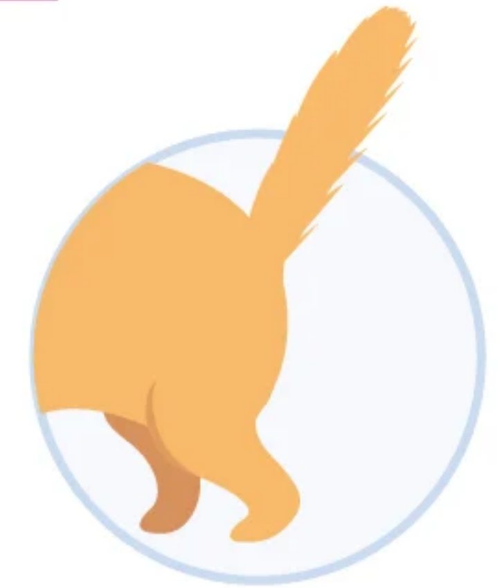
THREATENED or AGGRESSIVE