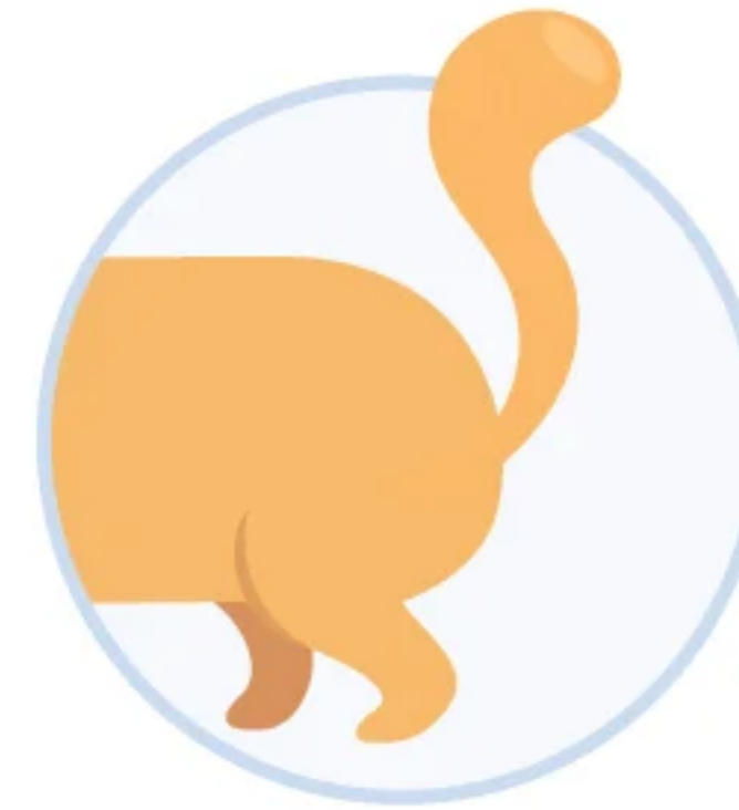
RELAXED or CONTENT