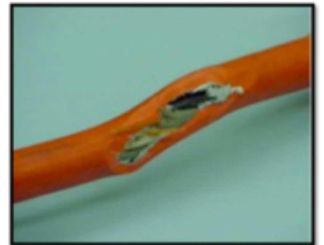
Image 2. Frayed Extension Cord