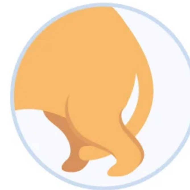
FEAR or SUBMISSION