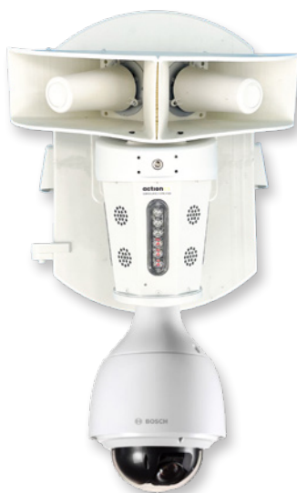
ACTION-CS EXTERIOR BACKPACK KIT WITH HORN, BACK BOX & SPEED DOME