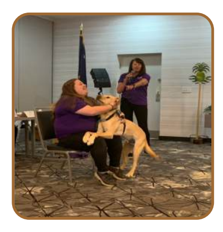
Saturday Morning presentation for PAALS