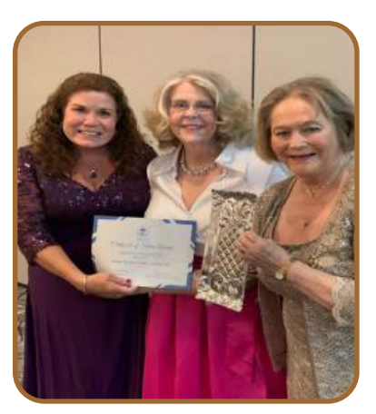
Saturday Evening Awards