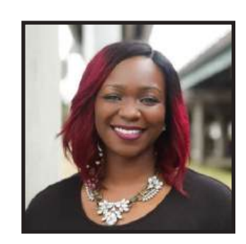
MESSAGE FROM GFWC-SC JUNIOR DIRECTOR

As I sit down to write this message, I am filled with a mix of emotions. My time as Director of Junior Clubs has been a journey of incredible experiences, meaningful connections, and growth. As I prepare to pass the torch, I want to take a moment to express my deepest gratitude to each of you for your unwavering support and dedication over the past few years. Together, we embarked on many initiatives, each one reflecting our shared vision of making positive changes in our communities and beyond.