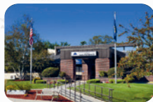
Salem, NH 70 Butler St.