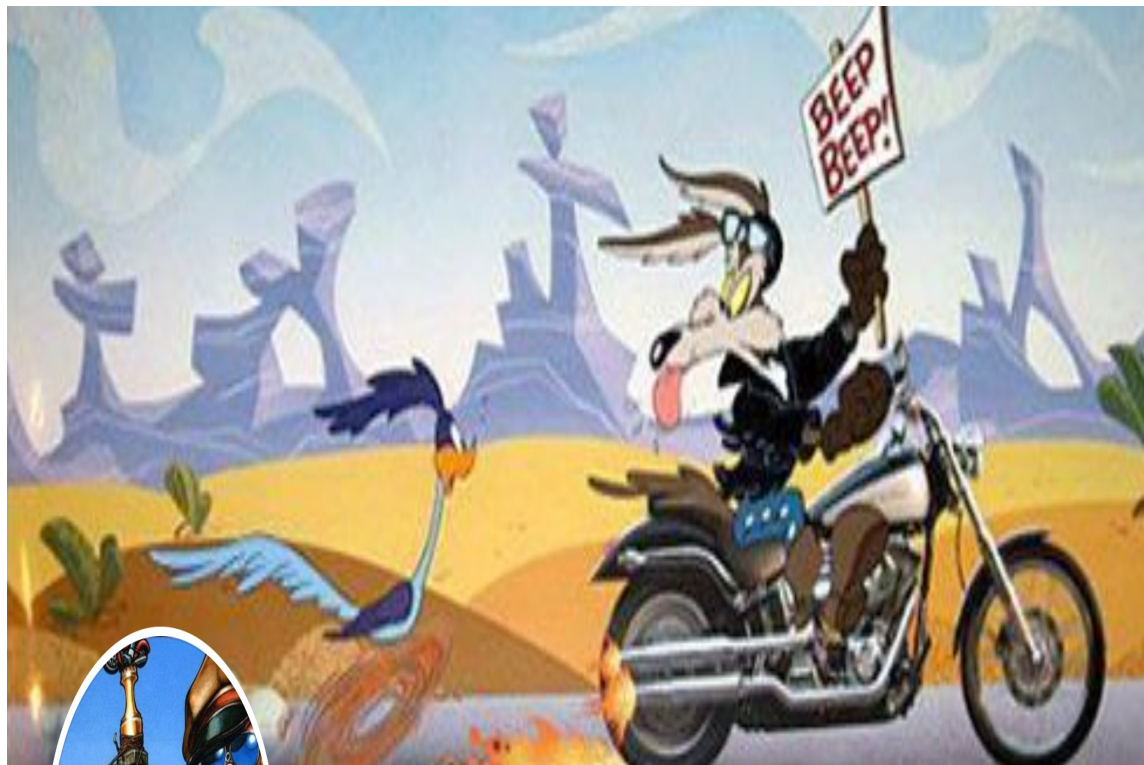
BIKER IN WOLVES CLOTHING