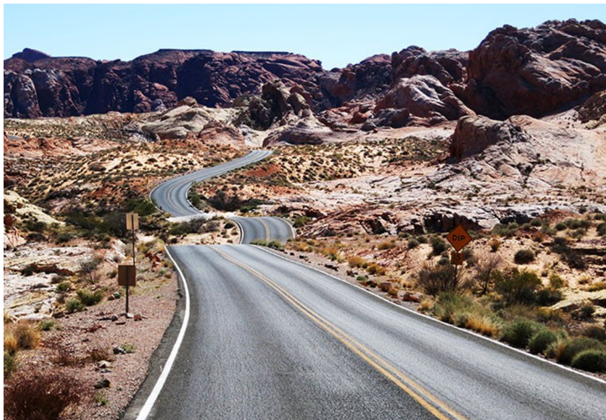
The mix of elevation changes and a smorgasbord of turns makes the ride through the Valley of Fire very entertaining.