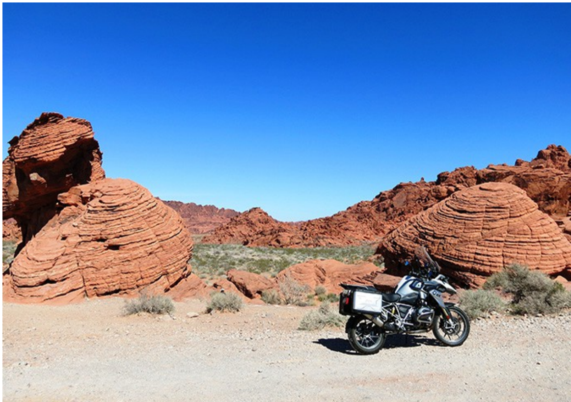
The Beehives are whimsical sentinels that add to the region's other-worldly feel.