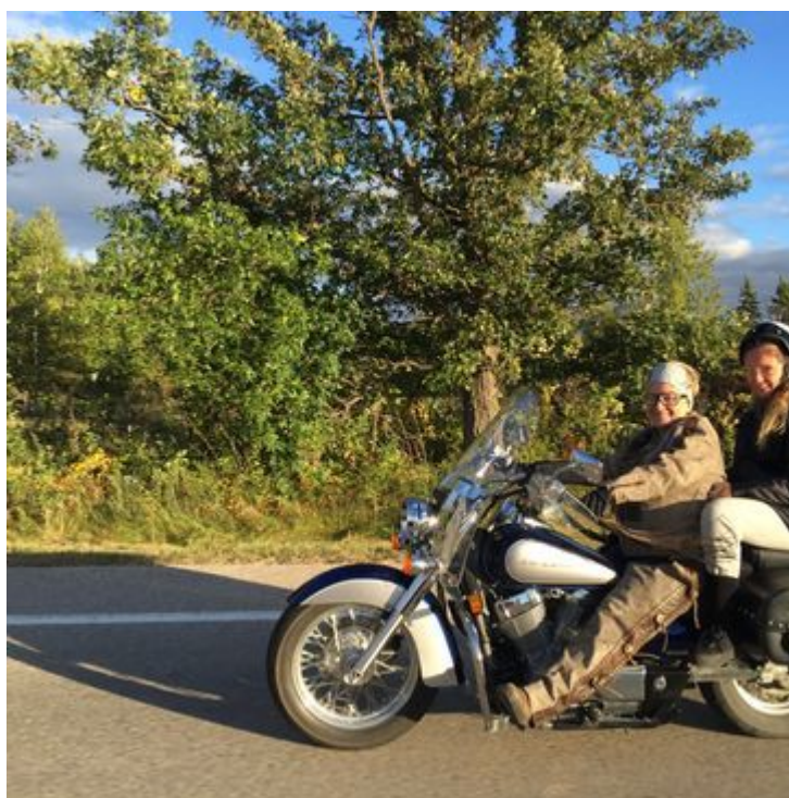
Old picture from the Archives.