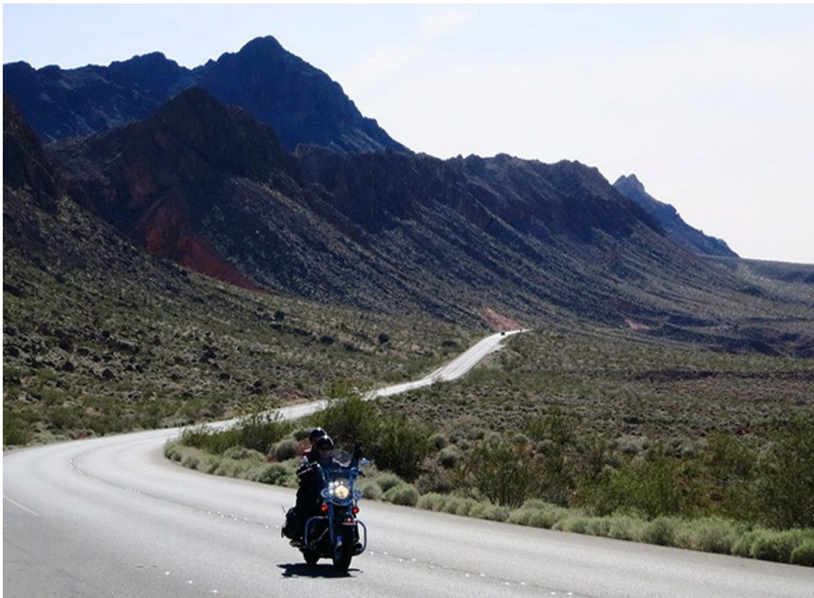
A fellow biker gives the universal salute as he rolls through Lake Mead National Recreation Area.