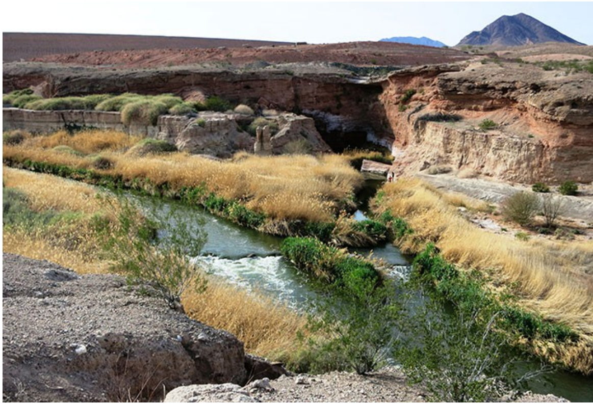
The Las Vegas Wash runs as a tributary to Lake Mead, adding yet another unique visual element to this great ride.