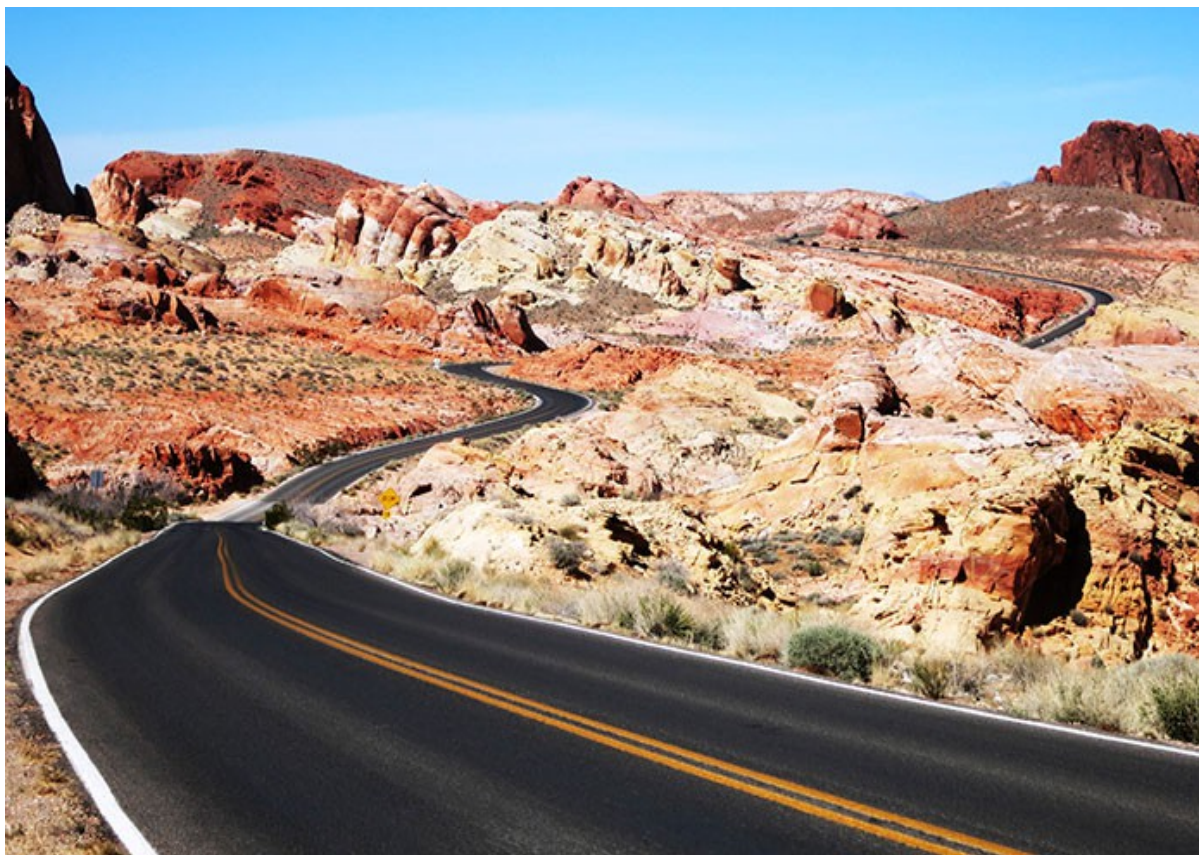
The various hues of the desert landscape in the Valley of Fire make for a ride with an almost cinematic feel.