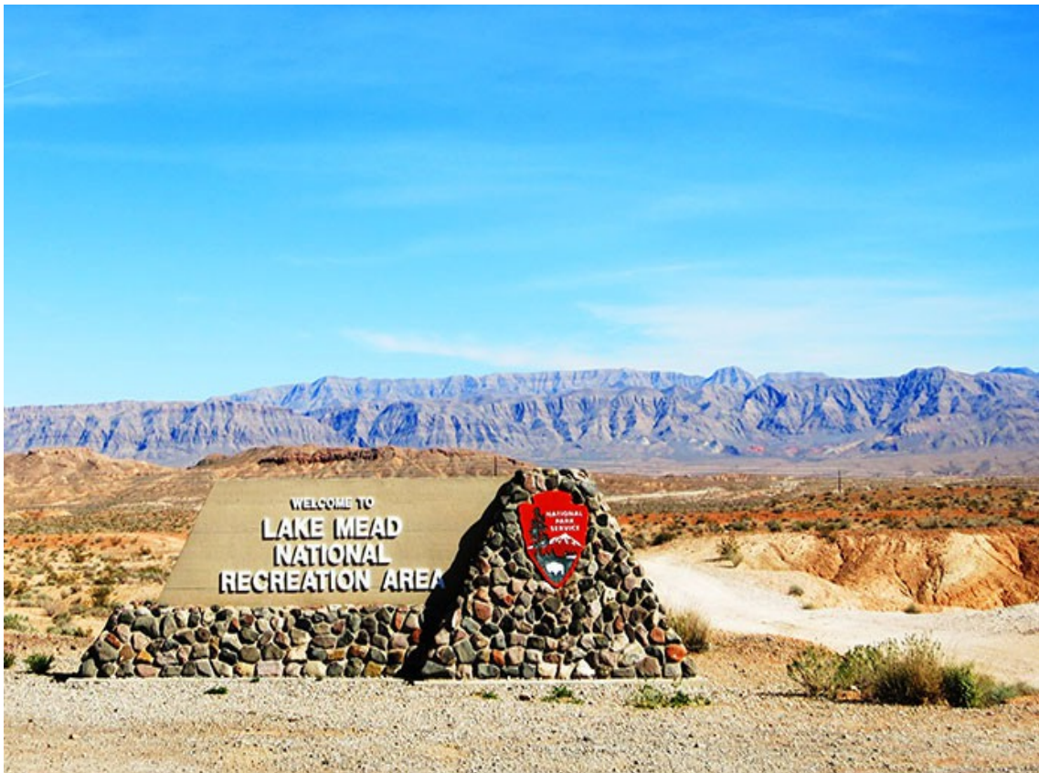
The terrain within Lake Mead National Recreation Area is stark, barren, and beautiful.