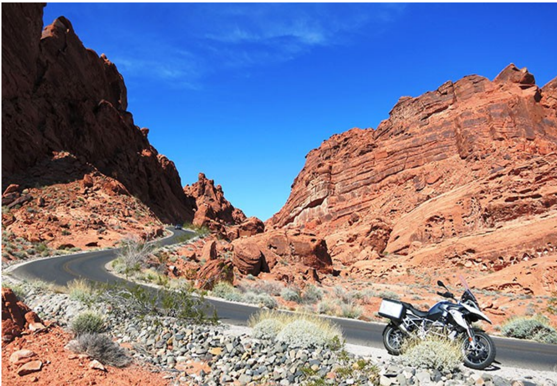
The roads in Nevada's Valley of Fire State Park cut through some of the world's most stunning red rock formations.