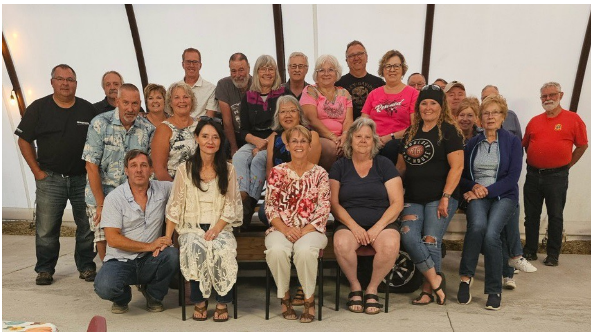
TMA WINDUP 2024