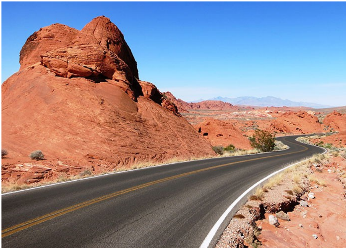
The smooth and well-maintained winding roads through the Valley of Fire are tailor-made for motorcycling.