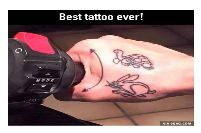
The wearable owners manual.