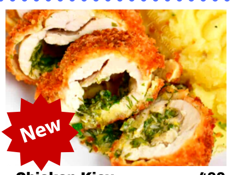
Chicken Kiev 480 A CLASSIC DISH CONSISTING OF A CRUMBED, THINLY POUNDED BONELESS CHICKEN BREAST FILLED WITH A DELICIOUS MIX OF GARLIC, HERBS & REAL BUTTER