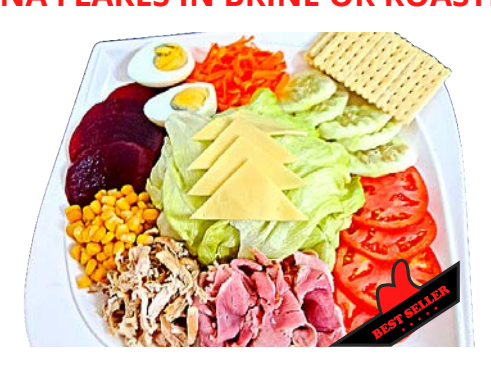
Chef Salad Plate OUR BAGUIO SALAD WITH THE ADDITION OF SMOKED HAM, CHEESE, ROAST CHICKEN & HARD BOILED EGG