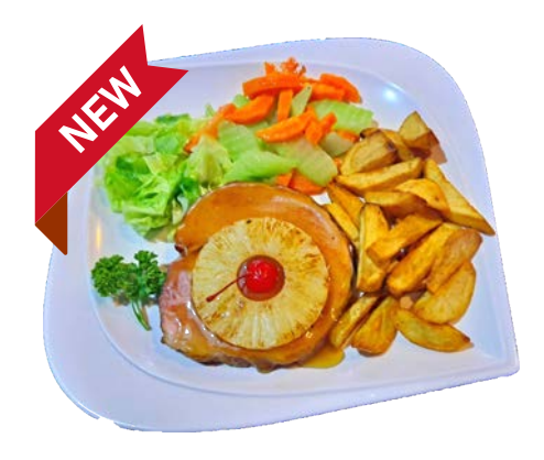
HAWAIIAN HAM STEAK 495 A THICK CUT PORTION OF CURED HAM STEAK COVERED IN A HAWAIIAN HONEY GLAZE, TOPPED WITH GRILLED PINEAPPLE AND SERVED WITH 2 SIDE DISHES