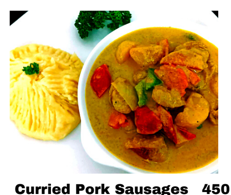
THIS DISH CONSISTS OF SLICED PORK SAUSAGES SIMMERED WITH VEGETABLES IN A MOUTH WATERING HOMEMADE CURRY