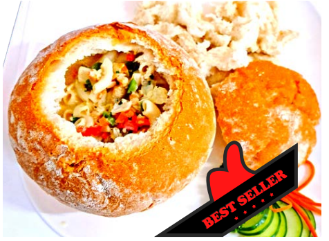
Sopas FILIPINO STYLE CREAM SOUP WITH CHICKEN, VEGETABLES & MACARONI IN A BUNNY BAKERY BREAD BOWL