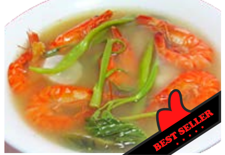
Sinigang with Shrimp 450 With Pork or Chicken 380 SHRIMP, PORK OR CHICKEN IN NATIVE VEGETABLES IN A SOUR & SAVORY TAMARIND BROTH