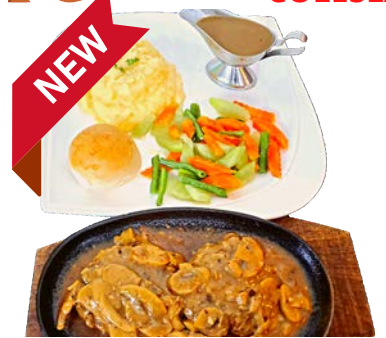
2 Salisbury Steaks 495 2 WELL SEASONED SALISBURY STEAKS SERVED ON A SIZZLING HOT PLATE COVERED IN MUSHROOM GRAVY WITH 2 SIDE DISHES

THESE LARGE MEALS COME WITH YOUR CHOICE OF ANY 2 SIDE DISHES CHIPS, MASHED POTATOES, BOILED POTATOES, JACKET POTATO, RICE, SALAD COLESLAW, POTATO SALAD or STEAMED VEGETABLES