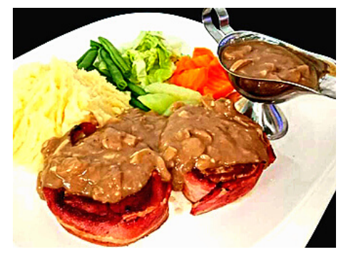
Pork Medallions 520 2 BACON WRAPPED PORK TENDERLOINS GRILLED TO PERFECTION AND COVERED IN A HEARTY MUSHROOM & GARLIC GRAVY. SERVED WITH 2 SIDE DISHES