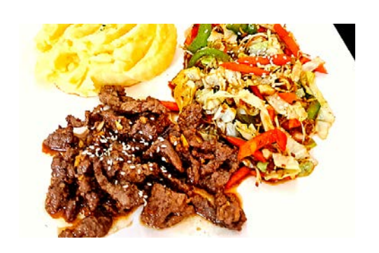
Mongolian Beef BEEF STRIPS STIR FRIED IN A MONGOLIAN SWEET & SAVORY BBQ SAUCE SERVED WITH YOUR CHOICE OF MASHED POTATO OR RICE