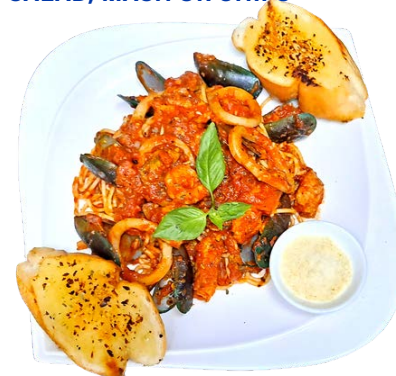
Spaghetti Seafood Marinara

A CREAMY WHITE SAUCE COVERING LONG STRANDS OF PASTA MIXED WITH TENDER PIECES OF LEAN CHICKEN