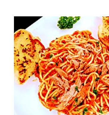
Tuna Marinara 420 ITALIAN STYLE MARINARA SAUCE LOADED WITH TUNA FLAKES, GARLIC, ANCHOVIES & CAPERS WITH YOUR CHOICE OF PASTA

A CLASSIC ITALIAN STYLE MARINARA SAUCE FILLED WITH FISH PIECES, SHRIMP, CALAMARI, MUSSELS AND YOUR CHOICE OF PASTA