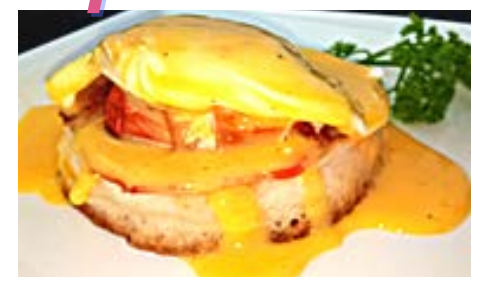
2 Crumpets 160 1 Fresh English Muffin 80 OUR HOMEMADE SQUARE CRUMPETS OR ENGLISH MUFFIN SERVED WITH BUTTER & JAM