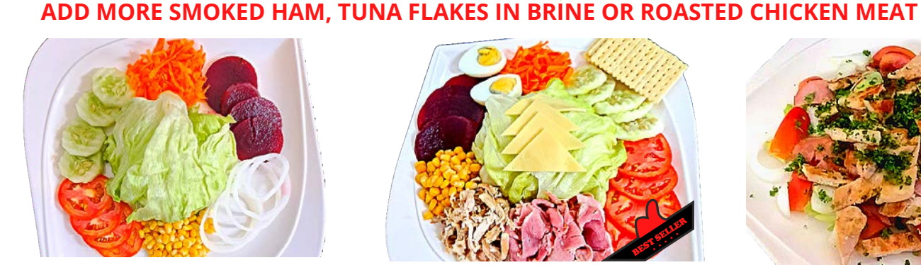
Baguio Salad Plate FRESH CRISP LETTUCE, GRATED CARROT, CUCUMBER, TOMATO, SWEETCORN & BEET ROOT