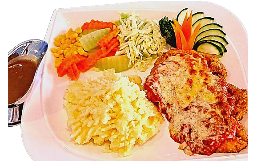
Chicken Parmigiana 495 OUR SUCCULENT CHICKEN SCHNITZELCOVERED WITH ITALIAN TOMATO SAUCE & MELTED MOZZARELLA CHEESE