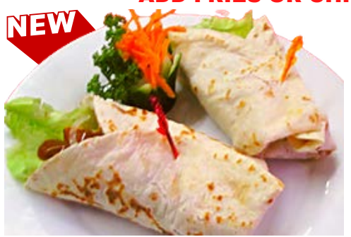
Grilled Chicken, Lamb 340 or Kebab Meat Wraps 2 TORTILLA WRAPS WITH FRESH LETTUCE, TOMATO, ONION WITH YOUR CHOICE OF MEAT & SAUCE

CHOOSE ONE OF OUR DELICIOUS SAUCES FOR YOUR MEAL Sour Cream - Garlic Ranch - Honey Mustard - Tomato - or Bunny BBQ ADD FRIES OR CHIPS TO ANY SANDWICH OR WRAP FOR ONLY P120