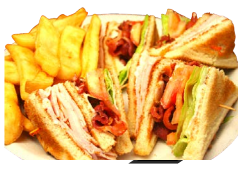
Club Sandwich & Chips 420 A DOUBLE DECKER TOASTED SANDWICH WITH BACON, EGG, CHICKEN, CHEESE, LETTUCE & TOMATO - SERVED WITH FRESH CUT CHIPS OR FRIES