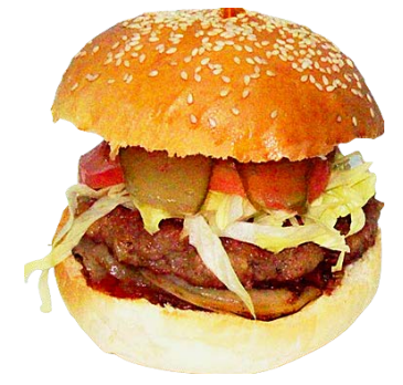
Uncle Sam Burger 320 155g ALL BEEF PATTY WITH LETTUCE, TOMATO, GRILLED ONION, DILL PICKLE AND SAUCE ON A BUNNY BAKERY BUN