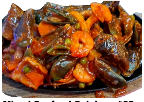
Mixed Seafood Salpicao 495 A MIX OF FISH, SHRIMP, SQUID, MUSSELS, CRAB & VEGETABLES IN A MILD TOMATO SAUCE SERVED ON A SIZZLING PLATE