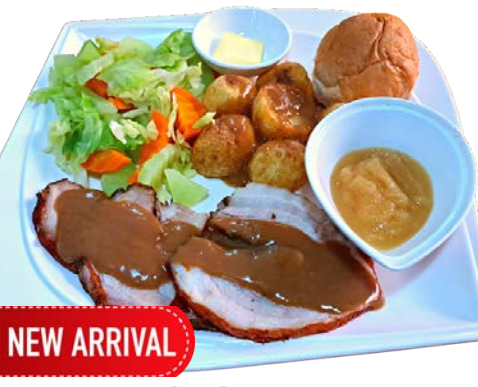
Roast Pork Dinner 495 SLOW ROASTED SEASONED PORK SERVED WITH 2 SIDE DISHES, APPLESAUCE, GRAVY AND A FRESH BUNNY BAKERY DINNER ROLL