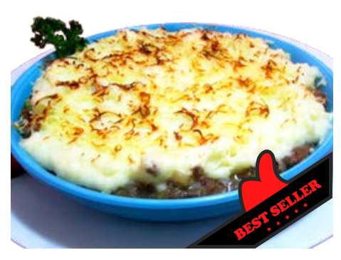
Cottage Pie 395 THIS AUSSIE / ENGLISH CLASSIC HAS A SAVOURY BEEF MINCE, VEGETABLES & GRAVY FILLING TOPPED WITH MASHED POTATO & MELTED CHEESE