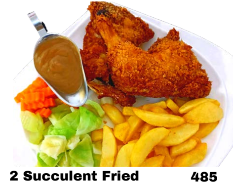
Chicken Leg Quarters 2 PIECES OF OUR JUICY FRIED CHICKEN QUARTERS IN OUR SPECIAL HERB RECIPE BATTER OR CRUMBED & SERVED WITH CHICKEN GRAVY