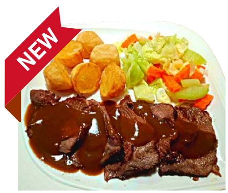
Roast Beef Dinner 200 GRAMS OF TENDER SLOW ROASTED BEEF WITH MIXED VEGETABLES, BEEF GRAVY AND CHOICE OF ANY STYLE POTATO