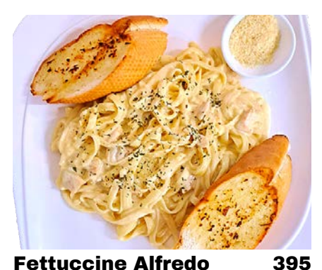
Alfredo with Shrimp ADD Broccoli for only

Spaghetti Bolognaise 395 LARGE SERVING OF OUR PERFECTLY PREPARED SPAGHETTI COVERED IN THE CHEF'S CLASSIC TOMATO RAGU MEAT SAUCE