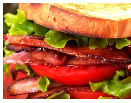
B.L.T. 260 CRISPY BACON, CHILLED CRISP LETTUCE, FRESH SLICED TOMATOES & A CREAMY MAYONNAISE, ON A BUNNY BAKERY SUGARFREE TOAST- A TRUE WESTERN CLASSIC