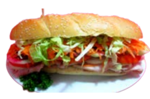
Salad Hoagie Roll FILLED WITH LETTUCE, TOMATO, ONION, CUCUMBER, GRATED CARROT & OUR HOMEMADE BUNNY BEETROOT