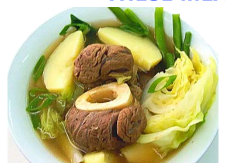
Nilaga Baka 495 THIS FILIPINO-STYLE BOILED SOUP WITH FORK-TENDER BEEF SHANKS AND VEGETABLES IS HEARTY AND TASTY