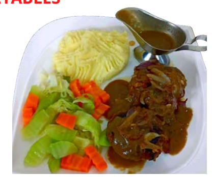
Beef Rissoles 2 LARGE BEEF RISSOLES SERVED WITH GRILLED ONIONS & ANY SAUCE YOU LIKE & 2 SIDE DISHES