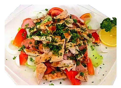
Warm Chicken Salad WARM CHUNKS OF CHICKEN, BACON, LETTUCE, TOMATO, ONION, CELERY, MAYONAISE, LEMON JUICE & CHOPPED PARSLEY