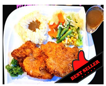
CRUMBED PORK CHOPS 520 2 PORK CHOPS COATED IN A FLAVORFUL BREAD CRUMB MIXTURE THEN FRIED UNTIL CRISP ON THE OUTSIDE BUT TENDER AND JUICY WITHINSERVED WITH A SIDE OF GRAVY