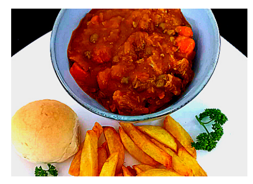
Beef Stew TENDER SLOW COOKED BEEF CHUNKS & VEGETABLES COMBINED IN A HOT POT STEW SERVED WITH RICE OR ANY STYLE POTATO