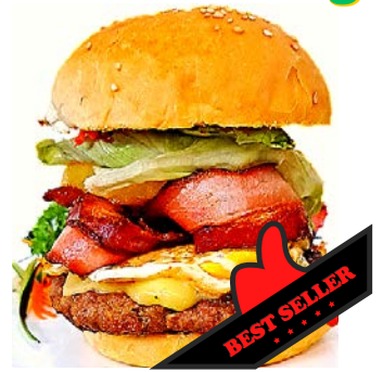
Aussie Works Burger 395 155g ALL BEEF PATTY WITH BACON, CHEESE, PINEAPPLE, EGG, LETTUCE, TOMATO, GRILLED ONION, GRATED CARROT, BEETROOT, AND CHOICE OF SAUCE