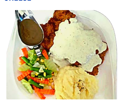
Country Fried Steak AMERICAN COMFORT FOOD BREADED & SEASONED BEEF MINUTE STEAK COVERED IN YOUR CHOICE OF CREAMY PEPPER, ONION OR MUSHROOM GRAVY & SERVED WITH 2 SIDES

SAUCES — PLAIN GRAVY, ONION, MUSHROOM, PEPPER OR GARLIC