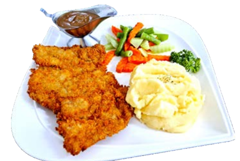
Chicken Schnitzel 450 A SUCCULENT TENDERIZED CHICKEN BREAST COVERED IN A LAYER OF CRUNCHY HERB INFUSED BREADCRUMBS SERVED WITH CHICKEN GRAVY