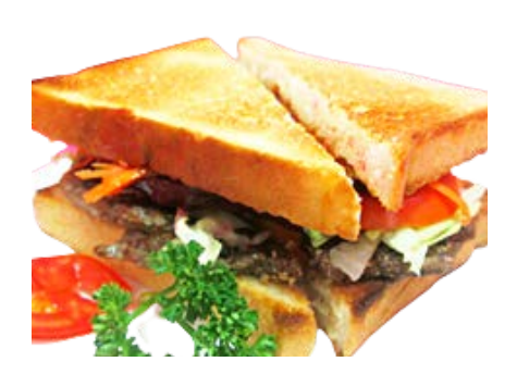
Aussie Steak Sandwich 350 Aussie Steak Burger

Plain Hamburger 155g ALL BEEF PATTY WITH LETTUCE, TOMATO, GRILLED ONION ON A BUNNY BAKERY BUN WITH CHOICE OF SAUCE