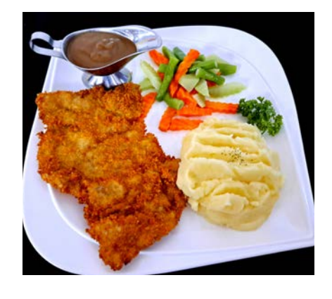
Pork Schnitzel JUICY AND FLAVORFUL PORK TENDERLOIN CUTLET WITH A CRISPY CRUMBED COATING THAT WILL HAVE YOUR MOUTH WATERING - SERVED WITH LEMON & GRAVY