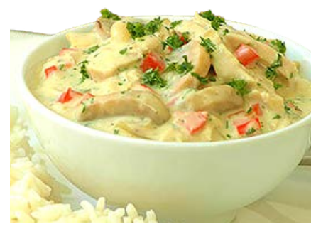
Chicken A La King CHUNKS OF CHICKEN BREAST & VEGETABLES SIMMERED IN A DELICIOUS CREAM SAUCE WITH RICE OR ANY STYLE POTATO