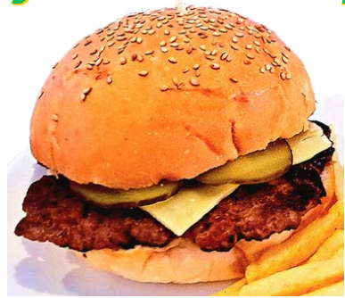
Cheese Burger 320 155g SEASONED ALL BEEF PATTY WITH CHEDDAR CHEESE, GRILLED ONION, DILL PICKLES AND CHOICE OF SAUCE ON A BUNNY BAKERY BUN