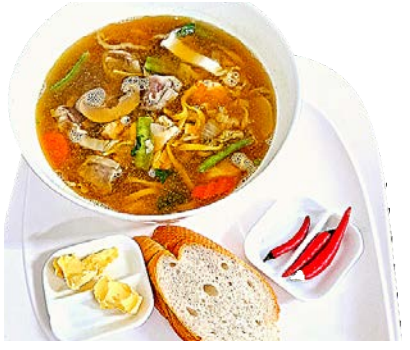
Oriental Won Ton Soup A CLEAR BROTH SOUP WITH PORK SIOMAI, EGG NOODLES, CHICKEN, VEGETABLES & SHRIMP SERVED IN A BOWL WITH FRENCH BREAD