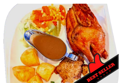
Roast Half Chicken 495 Dinner JUICY SLOW ROASTED HALF CHICKEN SERVED WITH STUFFING, ROAST POTATOES, VEGETABLES & CHICKEN GRAVY

THESE LARGE MEALS COME WITH YOUR CHOICE OF ANY 2 SIDE DISHES RICE - CHIPS - MASHED POTATOES - BOILED POTATOES - JACKET POTATO - SALAD COLESLAW - POTATO SALAD or STEAMED VEGETABLES