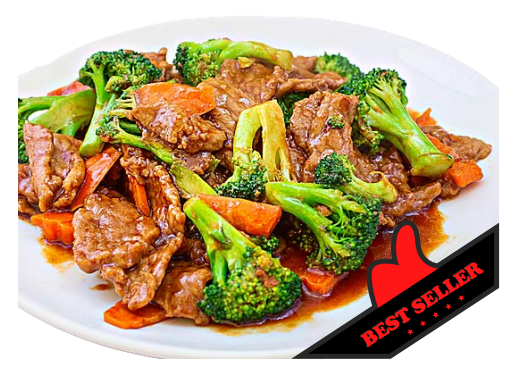
Beef & Brocolli 420 STIR FRIED BEEF MIXED WITH FRESH BROCOLLI IN AN OYSTER SAUCE WITH VEG AND SERVED WITH RICE OR MASHED POTATO