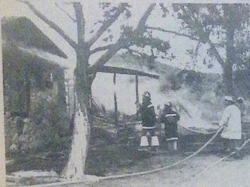
A grass fire near the house was put out earlier in the afternoon, but is not believed to have been the cause of the house fire. No official cause has been given.