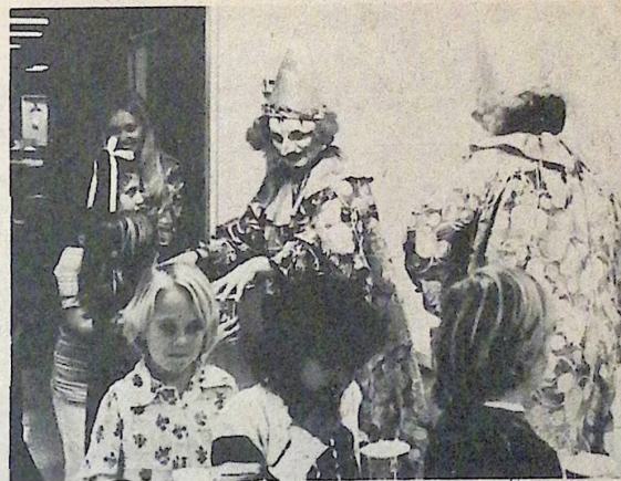
Northside ISD Guidance Office officials play clown and provide popcorn and sodas for the Boone Elementary School students whose efforts produced a 100 percent return on a Right-to-read parent poll.

The custom built house is 70 per cent brick masonry with central heating and air-conditioning. It is in this District, near Marshall High, Neff Middle School and Oak Hills Terrace Elementary.