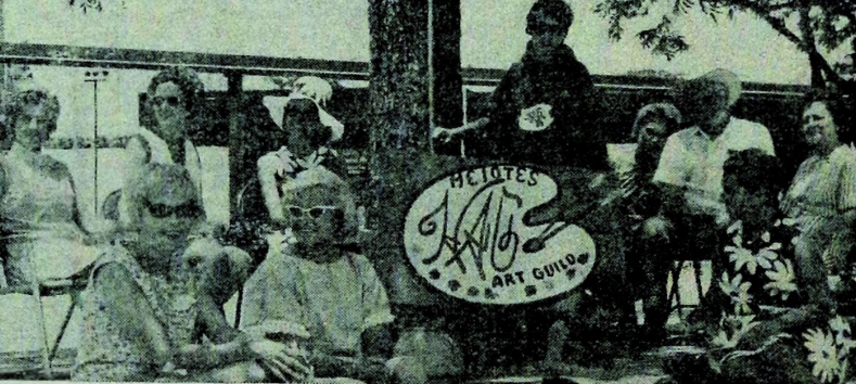
What's more fun than watching critics inspect your art? It's hearing what they have to say. Here some of the Guild members—who dis-