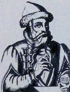
Johann Gutenberg of Mainz, Germany, is considered to be the inventor of printing because of his Bible, first book printed with movable type.

The University of Texas at Austin will share one of its greatest treasures—a copy of the rare Gutenberg Bible—with the people of San Antonio beginning June 17.