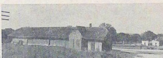
A once impressive railway station—hub of activity—is all but abandoned at Waring. A large one at Leon Springs no longer stands.