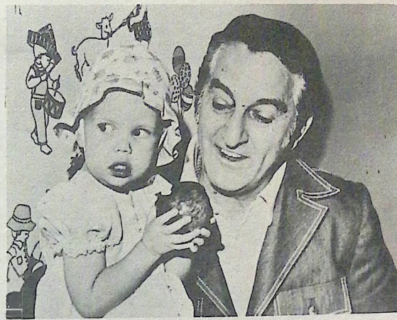
Visiting a little patient at St. Jude's Hospital is Danny Thomas, the TV and movie actor who has raised millions for the non-denominational children's hospital. Proceeds of the May 11 Cornyval parade bike ride will go to pay some expenses of little patients, like this one shown with Danny, at the research hospital.