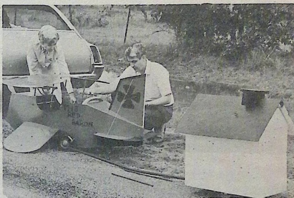
Floats come in all sizes in Cornyval parades from the gargantuan to the very little . . . "The Red Baron" made its appearance to the enchantment of crowds in a past Festival event. Surprises are now being dreamed up—in all sizes—for the May 11 parade through Helotes.