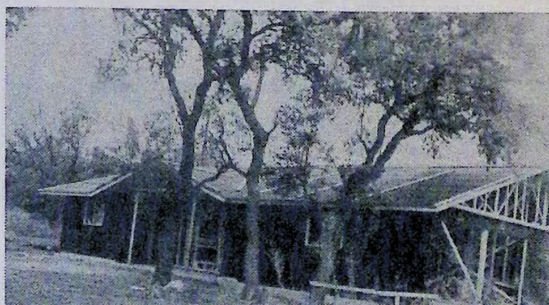
Nearing completion here is the first parsonage for the Helotes Hills Methodist Church. Ground-breaking ceremonies were recently held, and an open house is planned at a later date.

Under two ancient pecan trees and nearby giant oaks, 125 to 150 persons—residents of this area—gathered to listen and discuss the improvement of Highway 16. The meeting was called by the Texas Highway Department to allow discussion of the design of the nine-mile length from Scenic Loop Road to the Bexar-Medina County line.