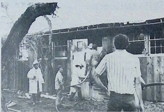
Bringing the hose inside the building are a group of volunteers. Damage is already visible on the roof and the back wall.