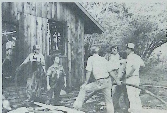
Smoke inhalation was an ever present danger, and firefighters here take a short break while others work inside.