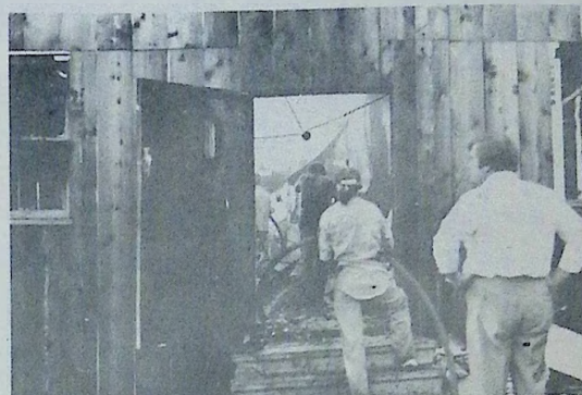
The inside of the building is still smoldering as firefighters continue their well-trained efforts. This view is from the front of the structure.

Plans were announced by the owners to rebuild the projected day care center and provide a new metal fire-proof building to be equipped with smoke alarms