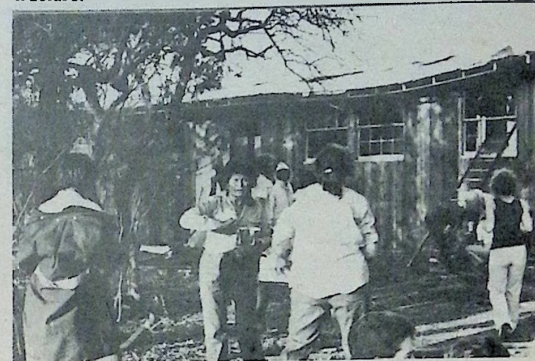
On duty to help prevent dehydration and to aid the firefighters in their efforts are the members of the Auxiliary, who train to be available in such an emergency.

and built-in fire extinguishing equipment.