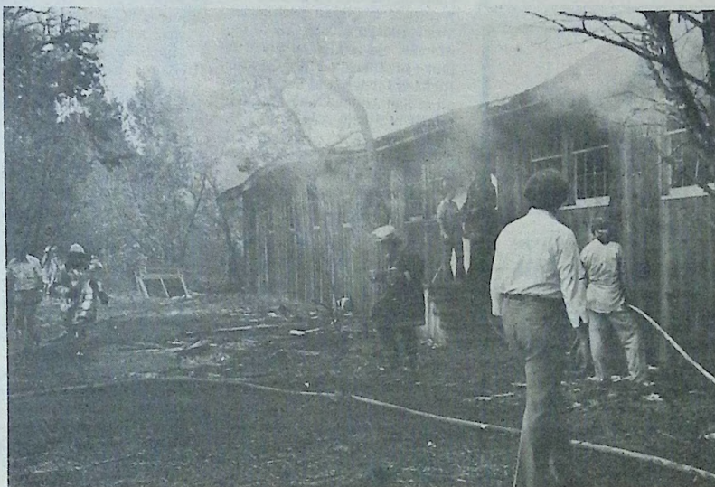
Smoke pours from the nearly completed day care center as firefighters from four volunteer fire departments work to subdue the flames. (Additional photos on Page Four)