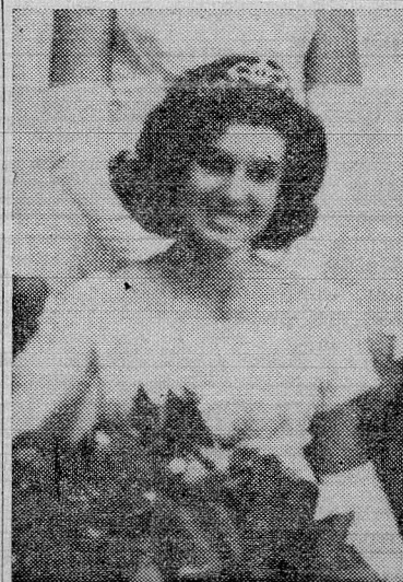
MISS HELOTES 1968

All property owners in the Playground—which is located in the City of Grey Forest—are eligible and old as well as new residents are invited to attend and to bring guests.