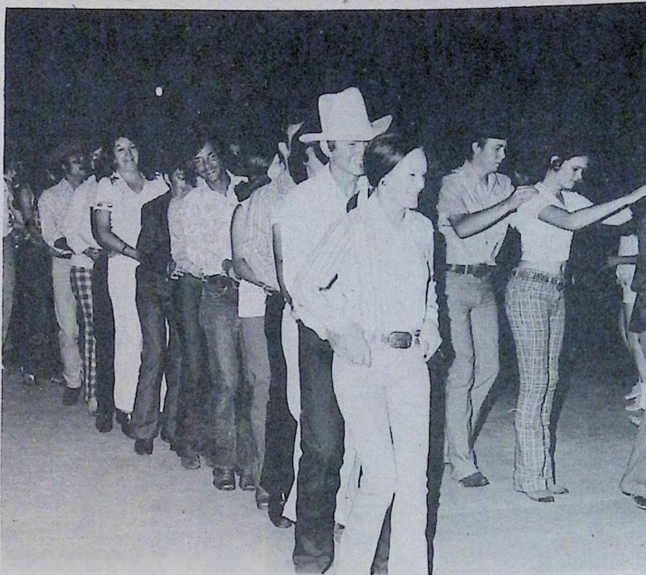
Visitors to the annual Festival as well as tourists find the local dance routines fun — especially when played by a real 'Helotes Sound' band. Here dancers enjoy the cool breezes on the patio of Floore Country Store, as they form a line.