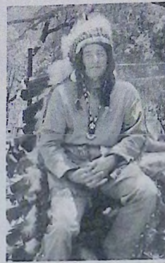
But others favor the costume in the original residents of Helotes—Indians who caught wild turkeys, it is said, to finish off their garb with a fine headdress.