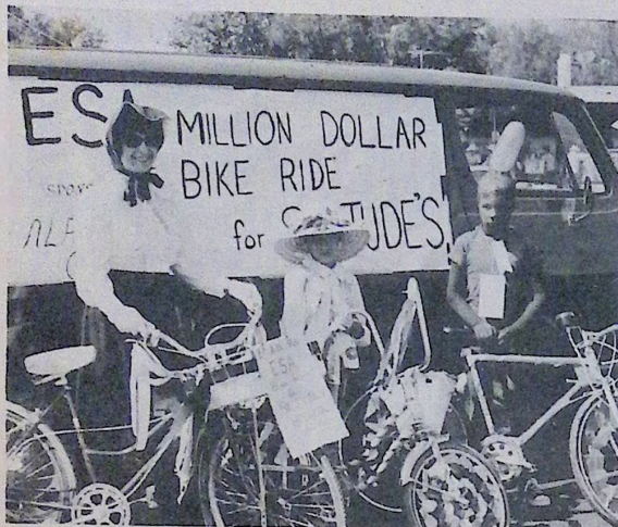
Prize-winning CORNYVAL Parade entry of the Epsilon Sigma Alpha sorority's Helotes chapter, Alpha Rho, not only looked good but did good—raising money for the hospital made famous by Danny Thomas—St. Jude's Children's Research Hospital. Shown here are riders with their decorated bikes.