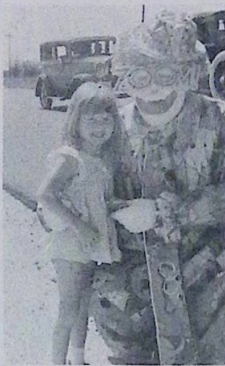
Clowns are bound almost to please everyone at a Festival—especially little ones like the little girl shown here from Leon Valley.

For more information on the film series call IWC at 828-1261.