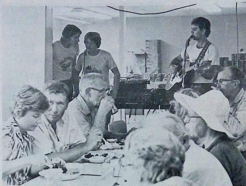
Comfort citizens and volunteer workers take break while cleaning up after flood.

All Northside Independent School secondary students wishing to participate in UIL sports activities during the 1978-79 school year must have a physical. They can receive the examination either from their family doctor or go to Paul Taylor Field House, Loop 410 at Culebra, for a free examination.