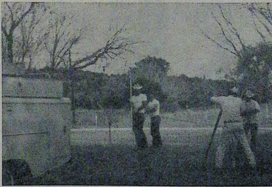
Winding up the survey of Highway 16's new route—as far as the Scenic Loop—are State Highway employees shown here just across Floore Road. Where grass grows now, work on a divided highway is scheduled to begin sometime this Spring.