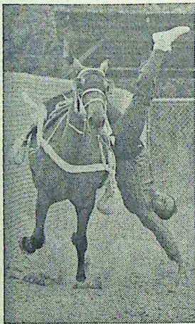
TRICK RIDING was a featured attraction at the third annual Hill Country Horse Show during the Cornyal. Here a rider balances precariously as his horse plunges along.