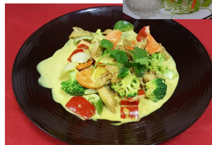
Chicken or Pork Curry