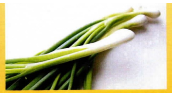
Hành Green Onion