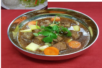
Pork Spare Rib Pot