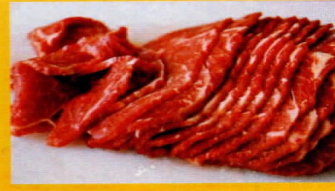
Tài Raw Beef