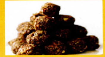
Bò Viên Meat Balls

*May be cooked to order: consuming raw or undercooked meats and unpasteurized milk and juice may increase of your food borne illnesses!