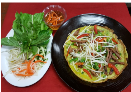
Chicken or Pork Crepes

Teriyaki Wing Plate with Rice & Salad.....$12.95