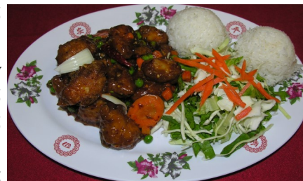
General Tao Chicken