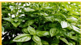
Quế Sweet Basil

***BUILD YOUR OWN OF PHỞ FOR THE SAME PRICE!*** (Select your Meats: Raw Beef, Brisket, Flank, Tendon, Tripe & Meat Ball)