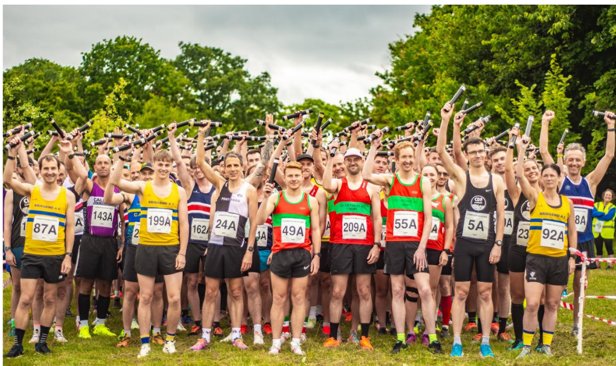
The 2025 Cosmeston Relay Race - 7:00pm, Weds. 9 th July