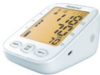
4G Blood Pressure Monitor