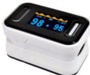
4G Pulse Oximeter