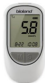
4G Blood Glucose Meter