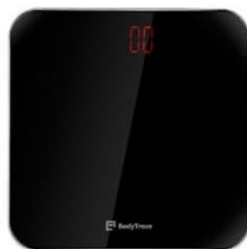
4G Weight Scale