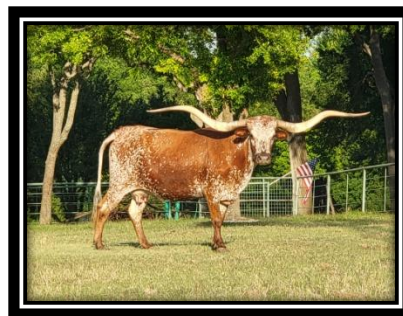
Sometimes it's better to try again later or on another day. The results can be great.