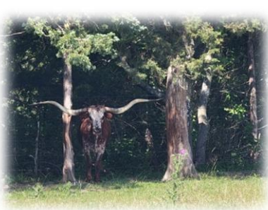
Know that there will be days that your subject matter is not going to cooperate.

As I stated earlier patience is a must have in some cases to get that great photo. There are days that you will find it is best to just walk away and come back later or even on another day. Its all part of the joys of working with livestock. You can't force cattle to cooperate with your photographing schedule. This lack of cooperate is why we see so many poor quality photos in catalogs, on websites and social media. Owners go to the pasture to snap a quick photo, after all how hard could it be to take a photo. Once in the pasture they find that they can't get the cattle to cooperate so they give up and just snap what they can to meet the sale deadline. They don't think about how that poor photo may be costing them on the sale price of their animal. Especially with so many online buyers participating in sales now days. Good quality photos are a must in today's competitive market place.