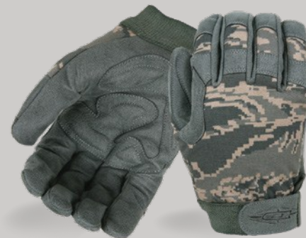
MX25-ABU (ABU Digital Camo)