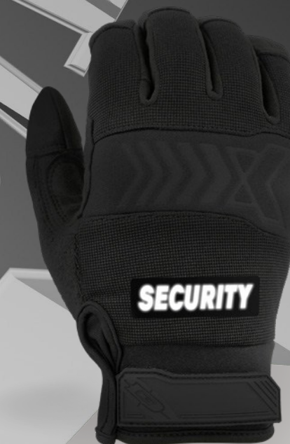
4 3M™ SCOTCHLITE™ REFLECTIVE