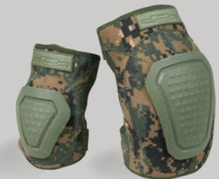
DNKP-DW/DNEP-DW (Digital Woodland Camo)