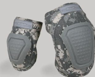
DNKP-A/DNEP-A (ACU Digital Camo)