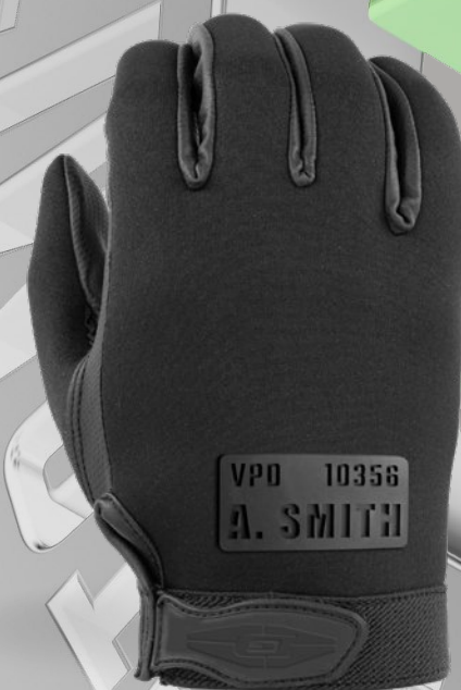
1 SILICONE ENGRAVING

* Customization fee applies. * Gloves sold separately.