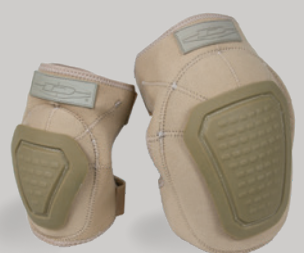
DNKP-T/DNEP-T (Coyote Tan)