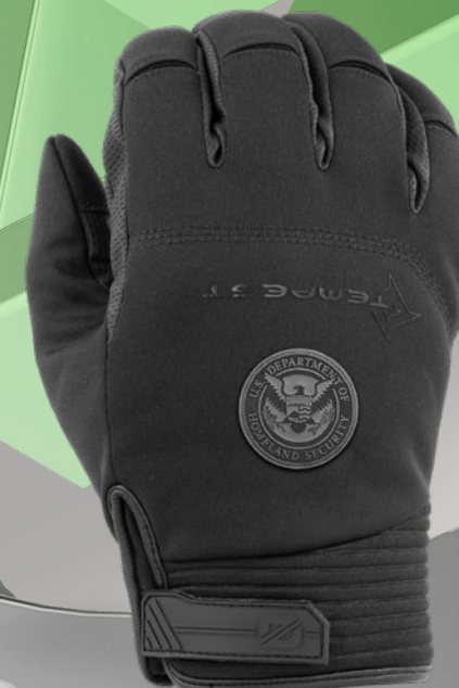
2 SYNTHETIC LEATHER ENGRAVING