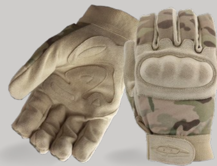
MX25-MH (MultiCam® Camo)