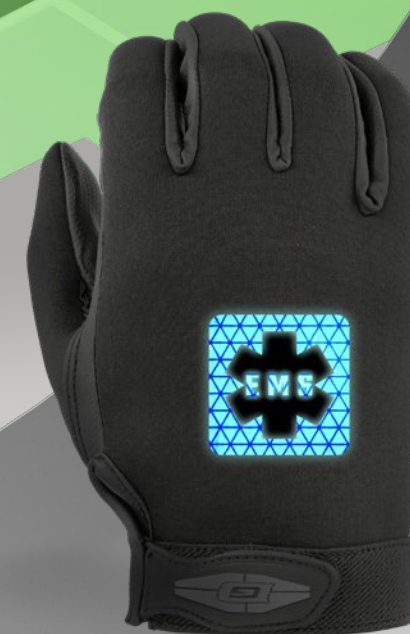
3 DAYBRIGHT® REFLECTIVE